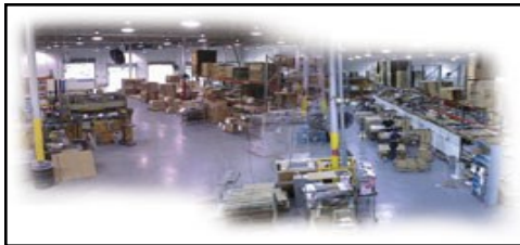
Our 105,000 square foot facility