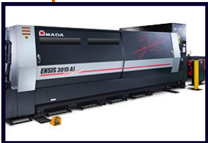
Amada ENSIS Fiber Laser

Exact Inc.'s primary objective is to provide precision sheet metal fabrications and assemblies for all industries. We have developed an ISO-Certified business system that provides us great control over the manufacturing process.