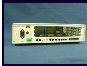
Telecommunications Aluminum Chassis including Electromechanical Assembly and Testing